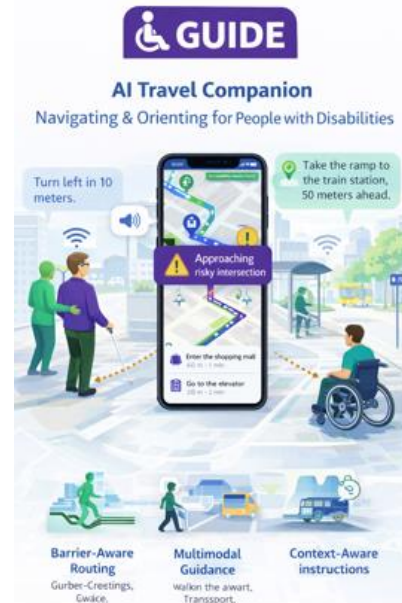
USP 5 Adaptive AI Journey Assistant