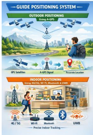
Positioning Outdoor (GPS) + Indoor (5G, Wi-Fi)