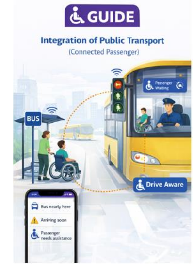
Public Transport Integration Connected Passengers