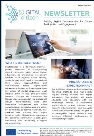
Digital Citizen (Erasmus+)