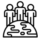
Growing population Food Security