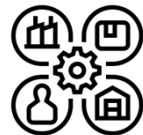
Complex supply chain