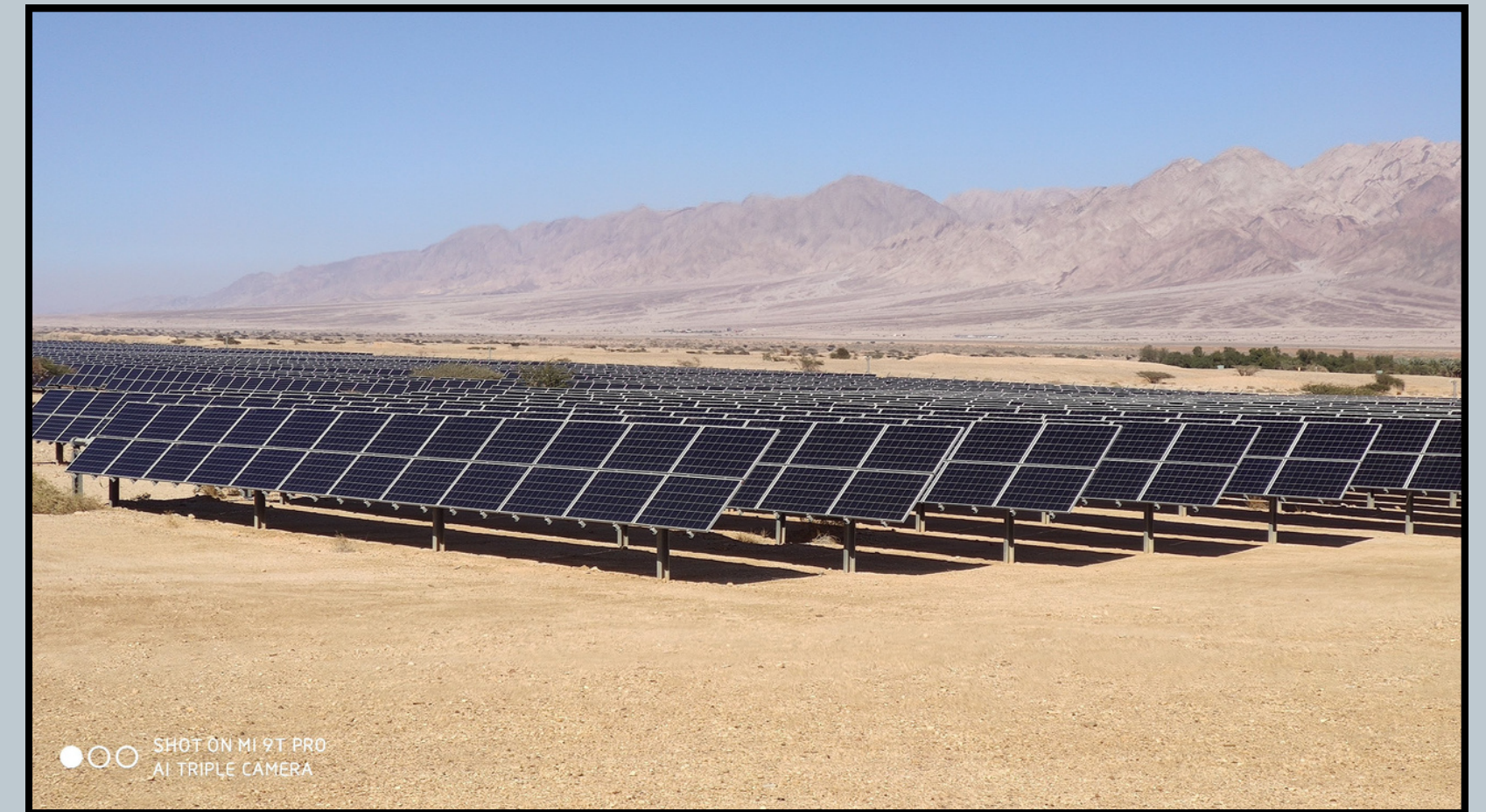
Yeelim School, Energy Independent, Eilat